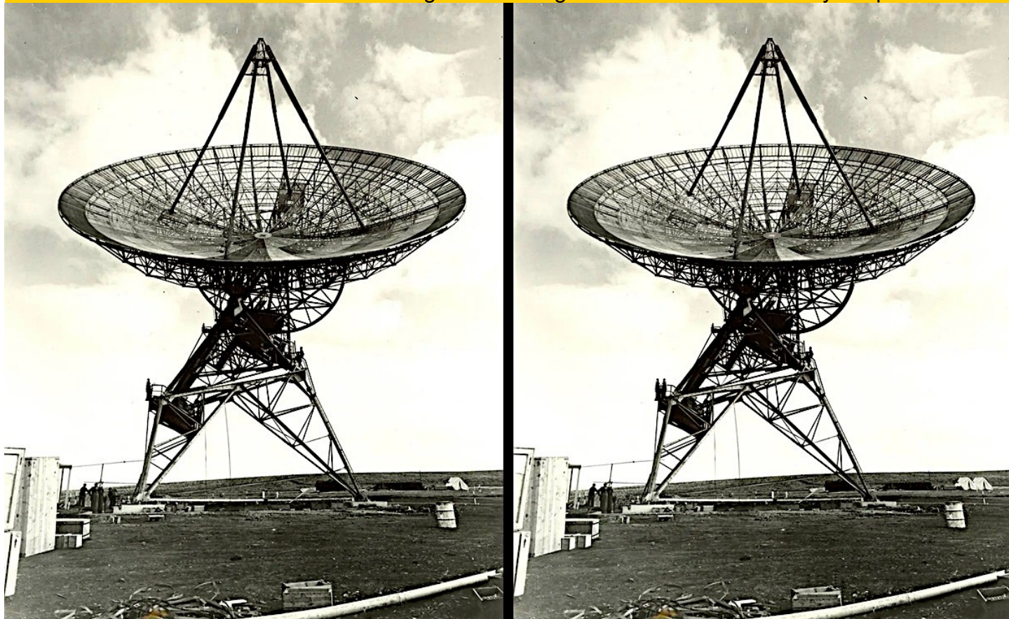
- Woomera 1964

SPOT THE DIFFERENCE The right-hand image has 10 alterations. Can you spot them?