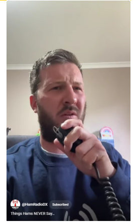
10 things never said