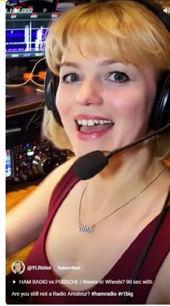
Ham Radio vs Porsche