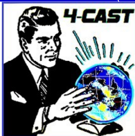
Forecast for East Lismore

6-DAY LISMORE (FORECAST). Click image to open METEYE (2480 for East Lismore).