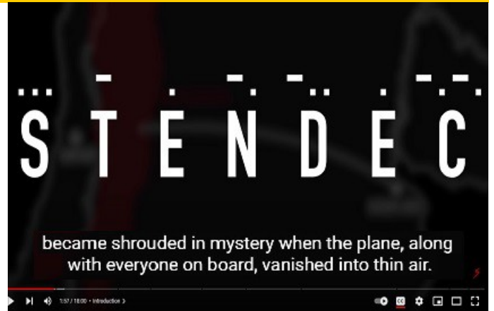
The various Morse code misunderstandings for STENDEC.