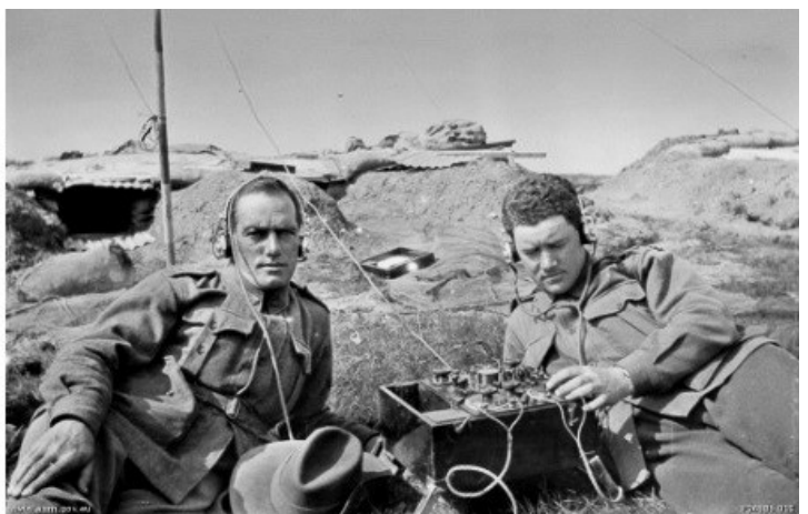
Australian signallers 1916

Right-hand image has 10 alterations, can you stop them?