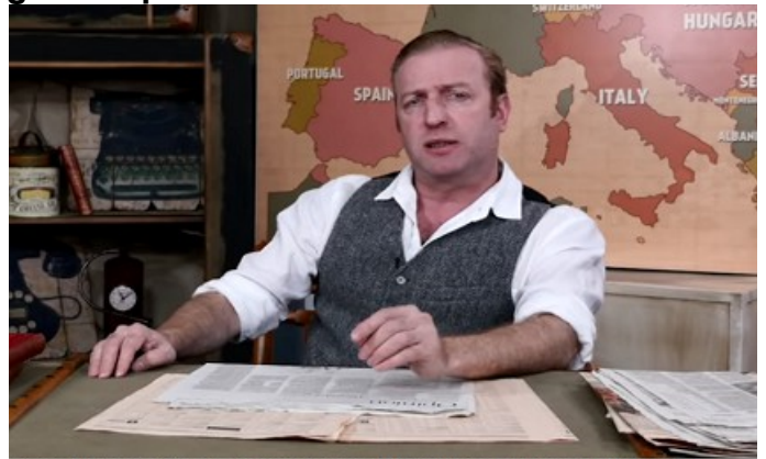
Beyond Wires and Pigeons - Communications in World War 1 | THE GREAT WAR Special