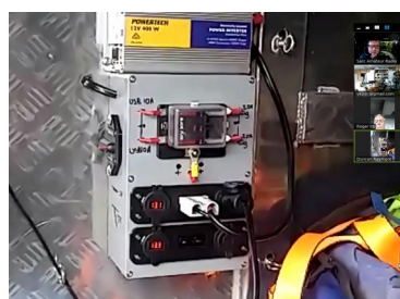
Jeff's DC setup...