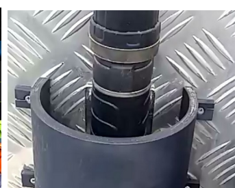
3D printed protector...