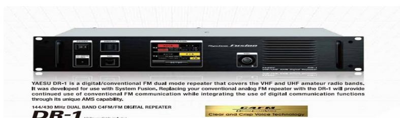
YAESU DR-1 is a digital/conventional FM dual mode repeater that covers the VHF and UHF amateur radio bands. It was developed for use with System Fusion. Replacing your conventional analog FM repeater with the DR-1 will provide continued use of conventional FM communication while integrating the use of digital communication functions through its unique AMS capability. 144/430 MHz DUAL BAND C4FM/FM DIGITAL REPEATER DR-1 AC Power Cable Included Clear and Crisp Voice Technology