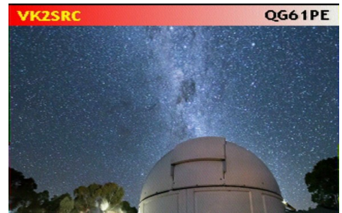
{from tonight's Digi Pix}

Friday Night Net – 7 - Winter Field Day participants