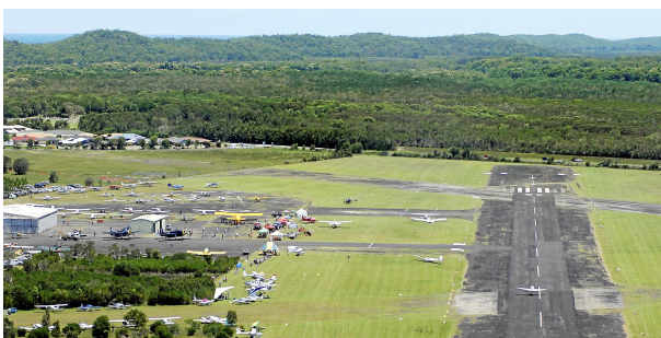
Previous Fly-in

More information: http://www.greasternflyin.com/